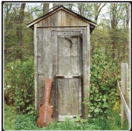
Ten Cents Short Of A Dime